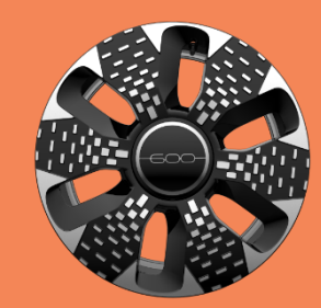
Standard Wheel 18" Alloy Wheels Diamond Cut