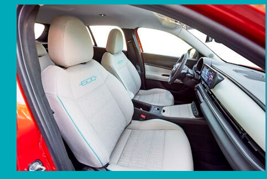
Standard Upholstery Full Ivory Fiat Monogram Leather Seat Upholstery