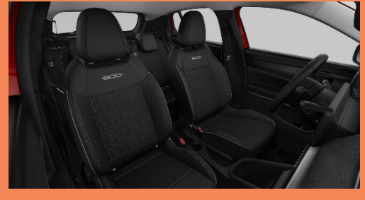
Standard Upholstery Black Recycled Fabric Seat Upholstery with Fiat Monogram