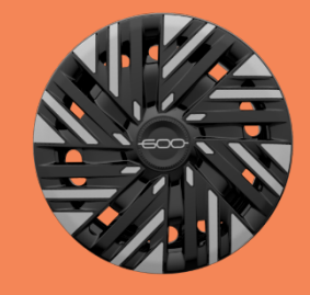
Standard Wheel 16" Steel Wheels with Covers