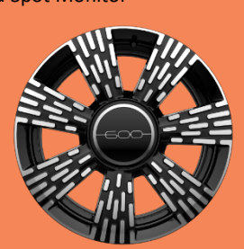
Standard Wheel 17" Alloy Wheels Diamond Cut