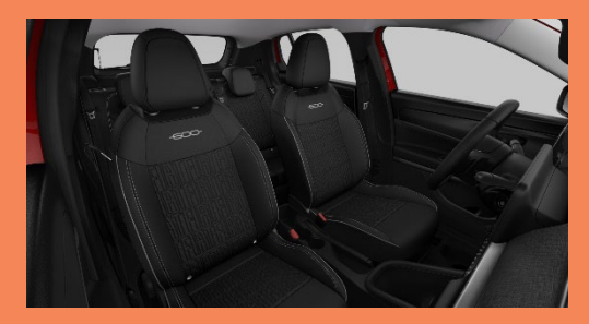
Standard Upholstery Black Recycled Fabric Seat Upholstery with Fiat Monogram