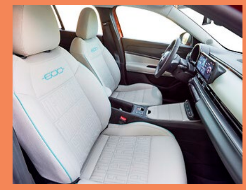
Standard Upholstery Full Ivory Fiat Monogram Leather Seat Upholstery