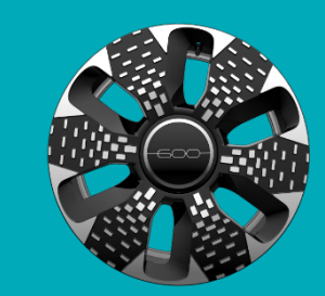
La Prima Standard Wheel 18" Alloy Wheels Diamond Cut