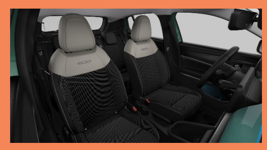
Black & Ivory Recycled Fabric Seat Upholstery with Fiat Monogram