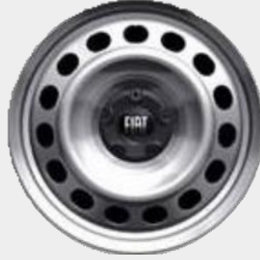
16" steel wheels with half hubcap