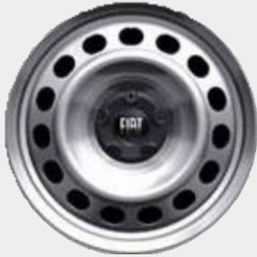
15" steel wheels with half hubcap