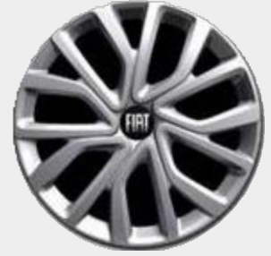
16" black steel wheels with fullsize hubcap